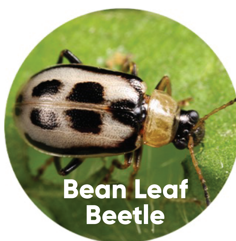
Bean Leaf Beetle